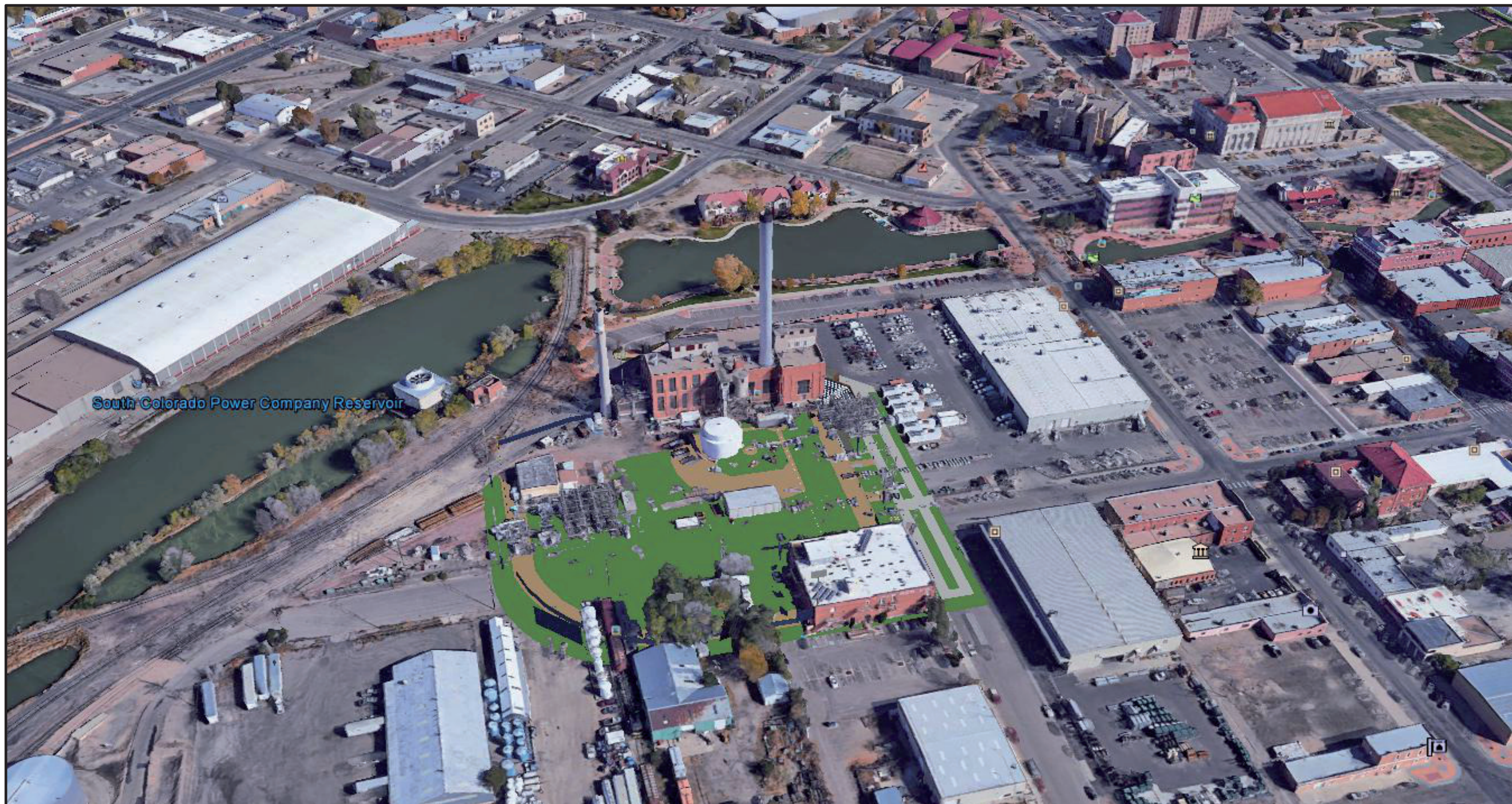
Downtown Youth Sports Complex