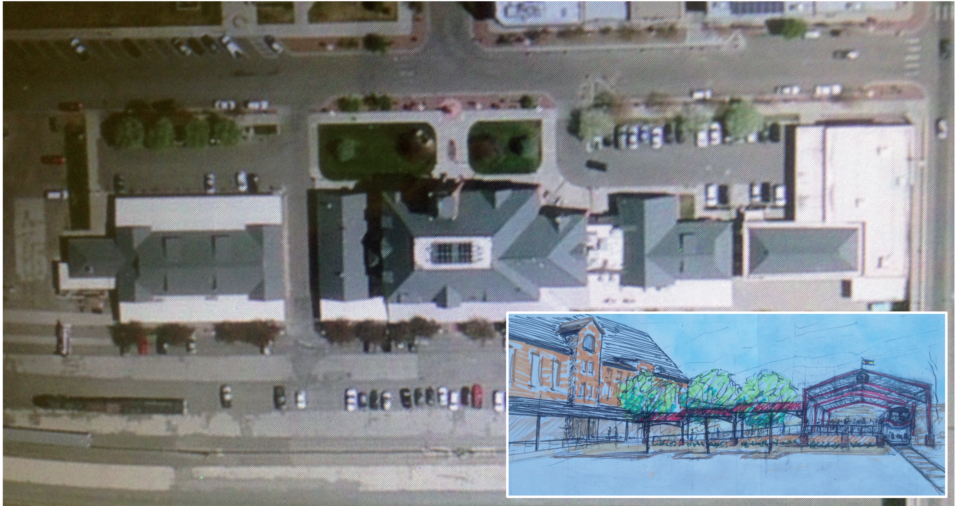
Southwest Chief to Pueblo